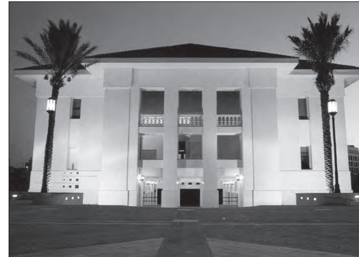
The Suzanne Dellal Center