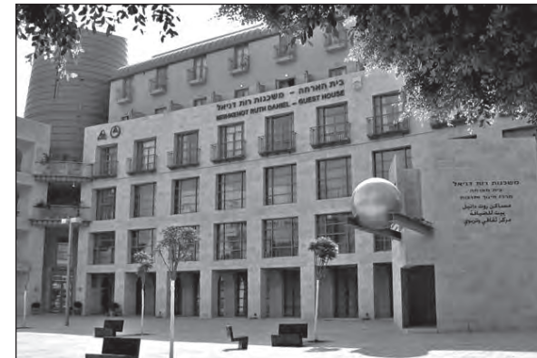
Mishkenot Ruth Daniel Guest House Part of the Reform Movement World Center