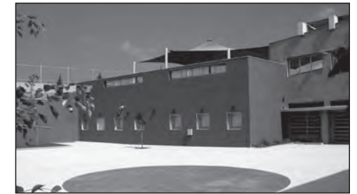
The Beit Venezuela School for Children with Special needs