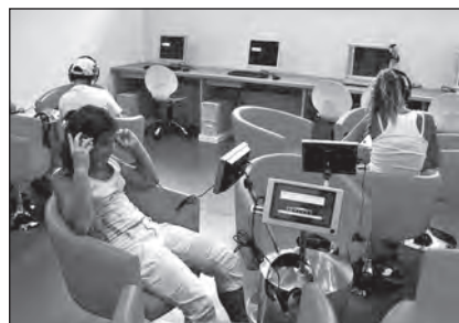
Students at The Peter Krueger Music Appreciation Hall