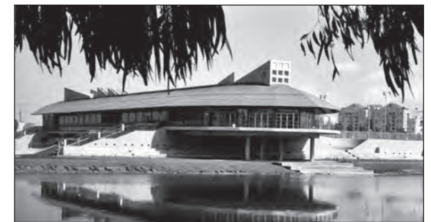
The Daniel Amichai Olympic Rowing Center