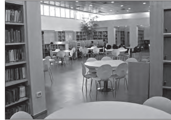
Moses Eichenbaum Library at Ironi Tet High School