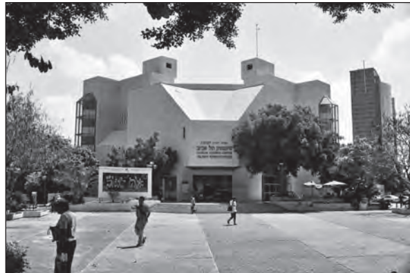
Doron Cinema Center The Tel Aviv Cinematheque