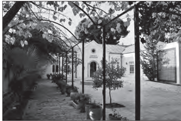
The Golda & Yehuda Zucker Senior Citizen Day Center

The Foundation works in partnership with the Municipality of Tel Aviv—Jaffa, which provides matching funds for nearly every project. The priority projects are set by Mayor Ron Huldai (the Foundation's International Chairman) and the City Council. Responsible and Purposeful, the Foundation provides for the needy, and creates opportunities for a better future for Tel Aviv and all of Israel.