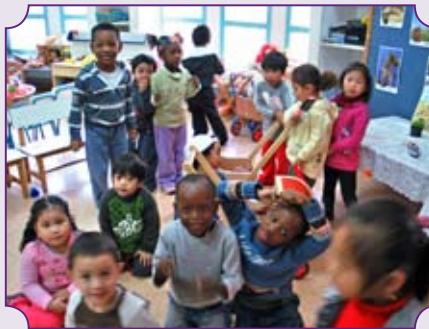
...so many toys and games...