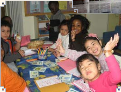
Children at work