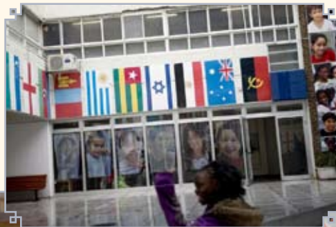
Flags representing the children's countries

Each and every one of us has a different opinion on how best to resolve the refugee and foreign worker problem. Unfortunately, the time for debate on the nature of the solution has long passed. In our current state of emergency, a decision on how to proceed must be made. Any decision that is implemented is better than no decision at all. I would end with " Cry, the Beloved Country, " but the country is already crying and nobody in Jerusalem is listening.