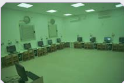
MASAD is so fun, I love the computer and gym activities the best. Aroi 5 year old student