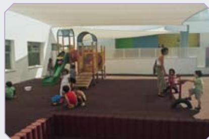
In the yard