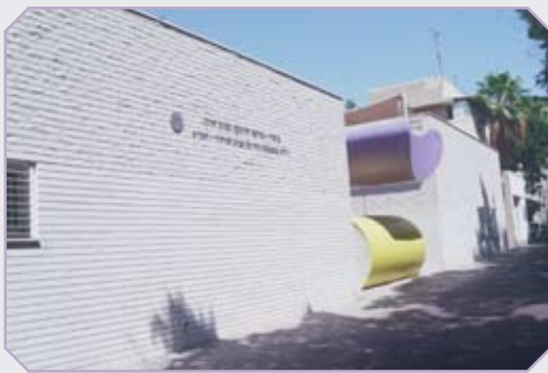
MASAD Educational Campus